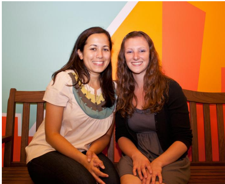
apple seeds Representatives