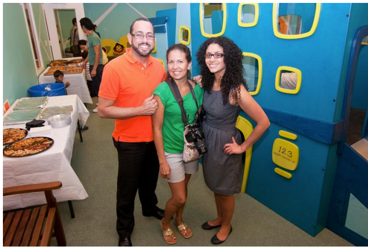
2 Gold Street parents stop by to check out the new children's playroom

that developers like TF Cornerstone are including modernized children's playrooms and are thinking about the whole family when building these new developments," he adds.